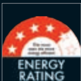
Cooling star energy rating